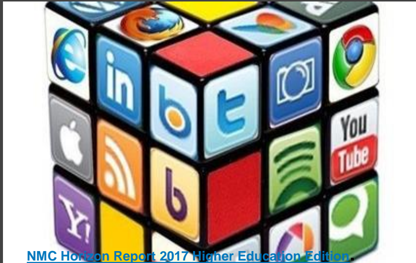
NMC Horizon Report 2017 Higher Education Edition