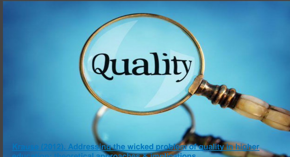
Krause (2012). Addressing the wicked problem of quality in higher education: theoretical approaches & implications.