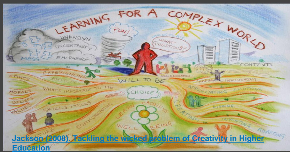
Jackson (2008). Tackling the wicked problem of Creativity in Higher Education